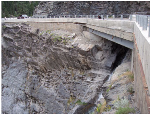
Million Dollar Highway bridge over Bear Creek Falls near Ouray.